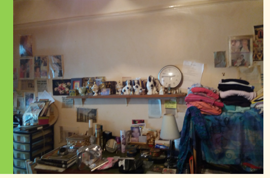
Sour Decorator Stephen is happy to support you in moving your furniture and person items so that any decorating work can be done to your full satisfacion.